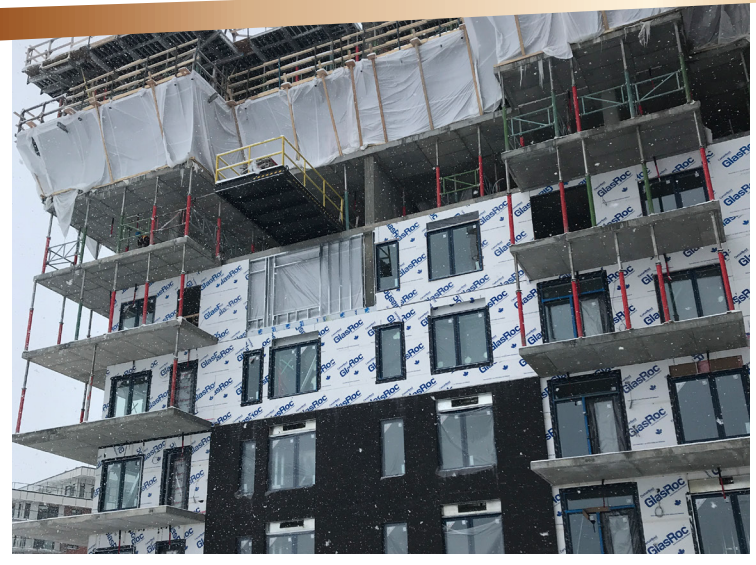
Example of productivity of the D-Max system. The cladding is installed from the ground floor to the third floor, the interior insulation is installed on levels 4 and 5 and the structure is poured on levels 6 and 7