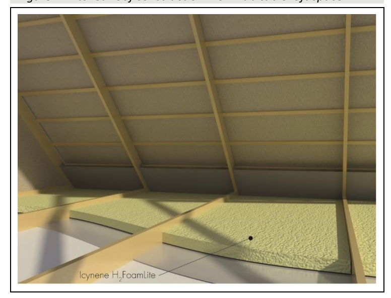
Figure 2 Pitched roof construction: non-habitable loft space