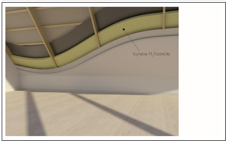
Figure 1 Pitched roof construction: habitable room in the roof

15.12 In cases of non-habitable roof constructions, a VCL/AVCL is placed (where necessary) at horizontal ceiling level. The ceiling should be well sealed.