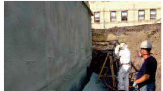
Drainage membrane that will be lifted in front of the foam as the soil is backfilled.