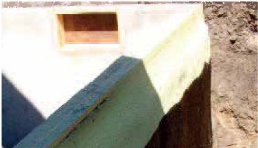
Bituminous coating applied directly over the foam.

However, Heatlok HFO is not a waterproofing product, so applying a polyurea, bituminous coating or drainage membrane directly on the foam is recommended in areas where water accumulates or the water table is high.