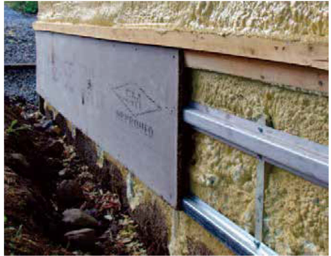
Example of the above-grade portion of the foundation during construction.

What about the above-ground portion of the foundation? Many options are available but one option is to install a structure (Z-bars are recommended) on the above-ground portion of the foundation only. This must be done before applying Heatlok HFO. Once the insulation work has been completed, we recommend installing a light-cement board on the Z-bars. A finish is then applied over the light-cement board once the backfilling has been completed to provide the desired appearance.