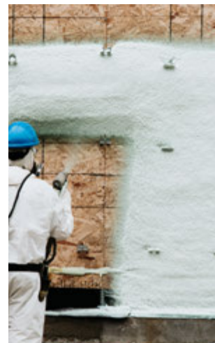
Exterior HFO Application