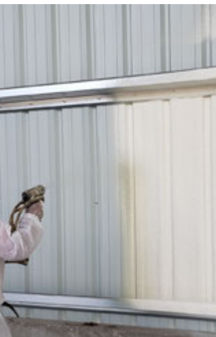
Continuous Insulation with Closed Cell Spray Foam