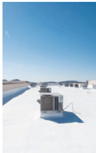
Roofing Foam with Coatings