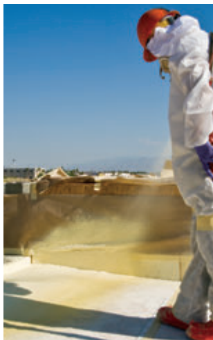
Roofing Foam Application